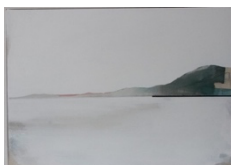
Anna F Macdonald Trinite Sur mer I, 2019 Acrylic on canvas 60 x 84 cm