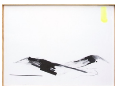
Anna F Macdonald Gloddfa Ganol II, 2020 Acrylic, Watercolour and Ink on Canvas 60 x 80 cm