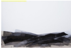
Anna F Macdonald Sun Over Blaenau Ffestiniog II, 2020 Acrylic, Watercolour and Ink on Canvas 115 x 165 cm