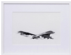
Anna F Macdonald Blaenau Preparatory Sketch I, 2020 Graphite and ink on paper 30 x 37 cm