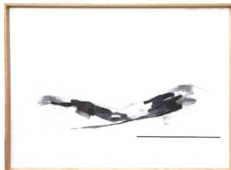
Anna F Macdonald Gloddfa Ganol I, 2020 Acrylic, Watercolour and Ink on Canvas 60 x 80 cm