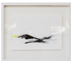
Anna F Macdonald Blaenau Preparatory Sketch VI, 2020 Graphite and ink on paper 30 x 37 cm